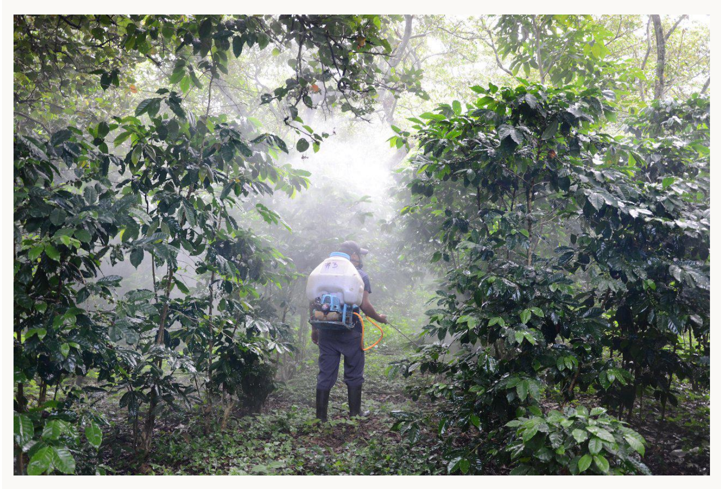
A farmer in Guatemala spraying fungicides.

At low altitude, applying fertilizer was more effective at controlling rust than spraying with fungicide.